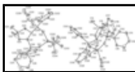
Fig. 1. A view of the two independent molecules of the title compound, with displacement ellipsoids shown at the 50% probability level.